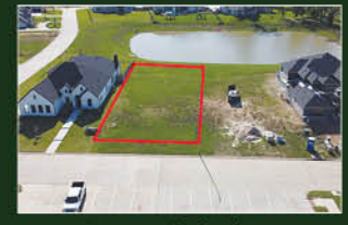
4107 Wooded Isle Way 1/4 acre, Backs to Pond Across Street from Pool & Tennis Courts • $105,000