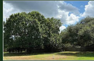
33307 Whiting 1/3 Acre in Cul-De-Sac $160,000