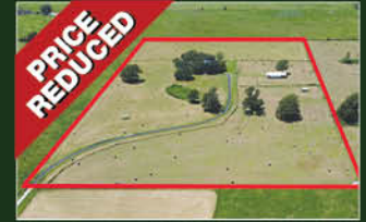
PRICE REDUCED 27+ Acres • 4903 Bowser Road Home, Guest House, Barn, Hay Pastures $2,300,000