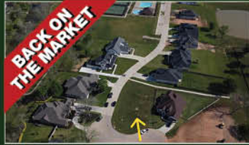
BACK ON THE MARKET 33007 Wicket Ct. Corner Lot in Park Special Pricing to Build