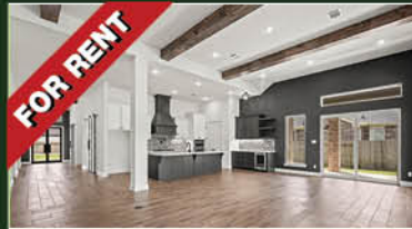
FOR RENT 3607 Wellborn 4 Bed / 3.5 Bath Like New Home For Rent $4,500 per month