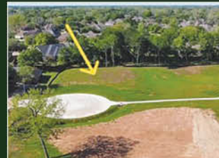
33206 Worthing Ln. 3/4 acre + lot overlooking pond. Special pricing to build