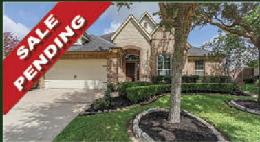
SALE PENDING 2906 Dunlin Terrace 3-4 Bed / 2.5 Bath / Generator Pool / Cul-de-sac / Fire Thorne