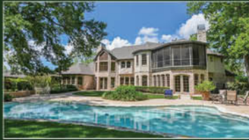
Beautiful French Country Home 5318 Westerham 4 Bed / 3.5 Bath / Pool / 4 Car Garage $1,200,000