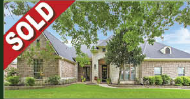
4218 Oxbow Circle East 4 Bed / 3.5 Bath / Pool / Cabana