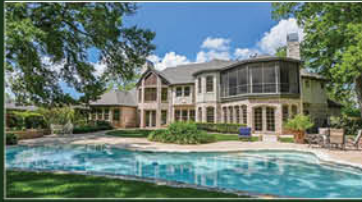
Beautiful French Country Home 5318 Westerham 4 Bed / 3.5 Bath / Pool / 4 Car Garage $1,200,000