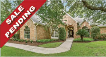
5434 Whitmore 3,102 s.f. / 4 Bed / 3.5 Bath Views from Hole 18 to 1 / $559,000