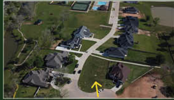
33007 Wicket Ct. Corner Lot in Park Special Pricing to Build