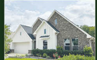
3326 Winterwood Way 2,621 s.f. • 3 Bed / 2 Bath Almost New Home • $524,000