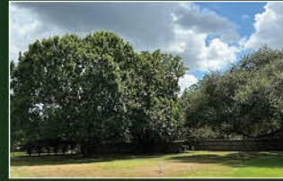
33307 Whiting 1/3 Acre in Cul-De-Sac $160,000