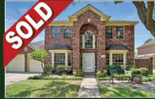
14103 Manderly 4 Bed / 3.5 Bath In Heart of Energy Corridor