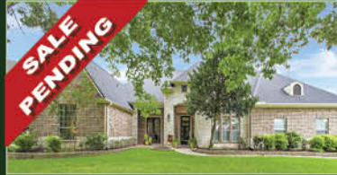
4218 Oxbow Circle East 4 Bed / 3.5 Bath / Pool / Cabana $839,000