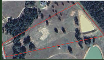
10 Acres near Franklin Between College Station & Waco Pond, Trees, Rolling Terrain $200,000