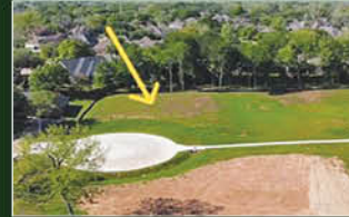
33206 Worthing Ln. 3/4 acre + lot overlooking pond. Special pricing to build