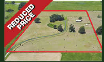
27+ Acres • 4903 Bowser Road Home, Guest House, Barn, Hay Pastures $2,300,000