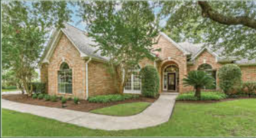
5434 Whitmore 3,102 s.f. / 4 Bed / 3.5 Bath Views from Hole 18 to 1 / $559,000