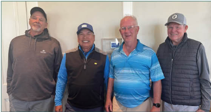
Winning team photo - 2025 SMGA Lone Ranger tournament

As you can tell from the team photo below, the weather was particularly chilly with a fresh northern wind despite it being the first day of spring.