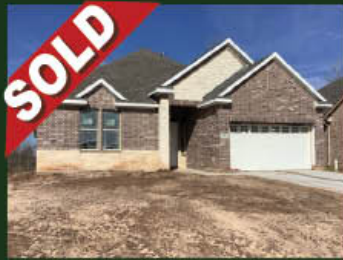
33006 Woodlake Dr. 3 Bed / 2.5 Bath / 2,641 s.f. NEW CONSTRUCTION