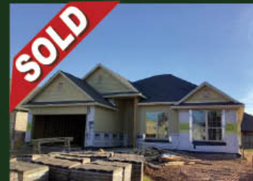
33026 Woodlake Dr. 4 Bed / 3 Bath / 2,455 s.f. New Construction