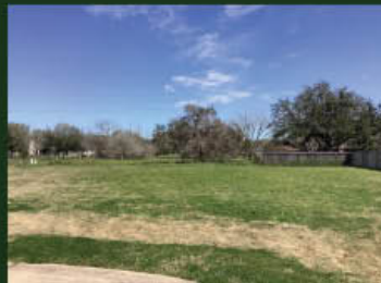
32707 Warbler Ct. 12,225 s.f. RESERVE SECTION 1 $129,900