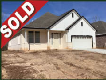
33010 Woodlake Dr. 3 Bed / 2.5 Bath / 2,461 s.f. NEW CONSTRUCTION