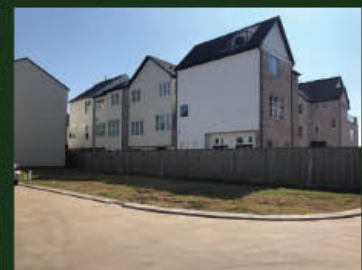
10923 Brookeshire Chase Townhouse Lot in Energy Corridor $120,000