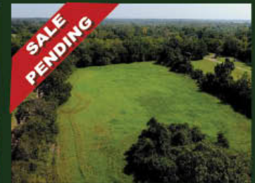
CR 151 in Boling 13 + Acres on San Bernard River $140,000