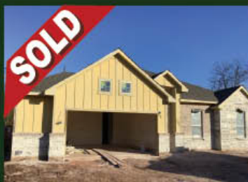
3802 Wild Willow Way 4 Bed / 3 Bath / 2,275 s.f.