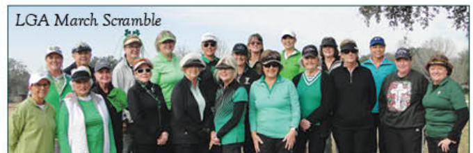
LGA March Scramble