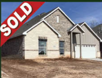
32914 Woodlake Dr. 4 Bed / 2 Bath / 2,331 s.f. New Construction