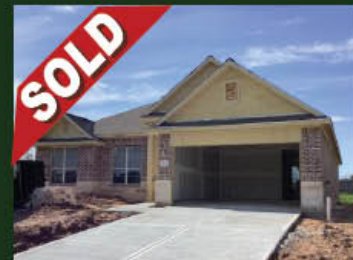
3803 Wild Willow Way 4 Bed / 2 Bath / 2,283 s.f. New Construction