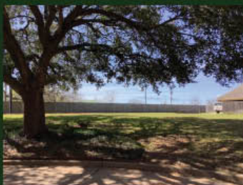
4519 Lake Village 9,816 s.f. lot $89,900