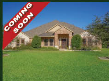
Over 5,000 s.f. on 1.1 Acres 4 Bed / 5 Bath / 4+ Car Garage Study / Game Room Guest Suite / No rear neighbor