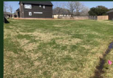
32802 Winslow Dr. 12,779 s.f. RESERVE SECTION 1 $124,900