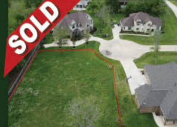
32823 Whistler Ct. Rare Weston Lakes Lot Half-Acre with plans