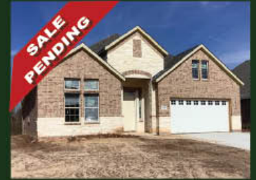
32918 Woodlake Dr. 4 Bed / 3 Bath / 2,642 s.f. New Construction $488,770