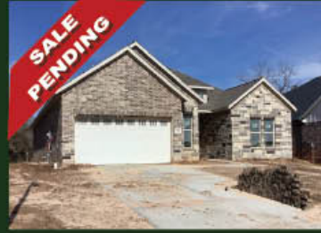
32910 Woodlake Dr. 3 Bed / 2.5 Bath / 2,450 s.f. NEW CONSTRUCTION $453,250