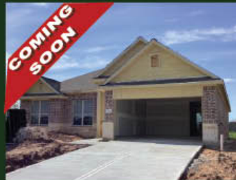
3803 Wild Willow Way 4 Bed / 2 Bath / 2,283 s.f. New Construction $422,355