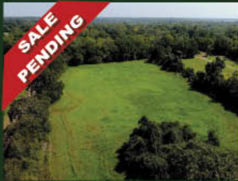
CR 151 in Boling 13 + Acres on San Bernard River $140,000