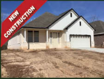
33010 Woodlake Dr. 3 Bed / 2.5 Bath / 2,461 s.f. NEW CONSTRUCTION $455,285