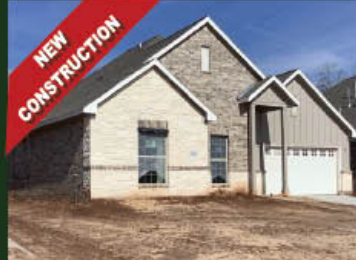
32914 Woodlake Dr. 4 Bed / 2 Bath / 2,331 s.f. New Construction $431,235