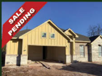
3802 Wild Willow Way 4 Bed / 3 Bath / 2,275 s.f. $420,875