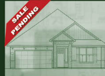
32026 Woodlake Dr. 4 Bed / 3 Bath / 2,455 s.f. New Construction $454,175