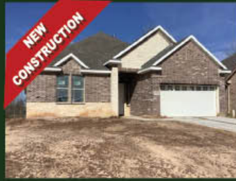
33006 Woodlake Dr. 3 Bed / 2.5 Bath / 2,641 s.f. NEW CONSTRUCTION $488,585