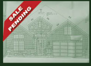
32918 Woodlake Dr. 4 Bed / 3 Bath / 2,642 s.f. New Construction $488,770