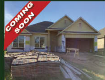
3803 Wild Willow Way 4 Bed / 2 Bath / 2,283 s.f. New Construction $422,355