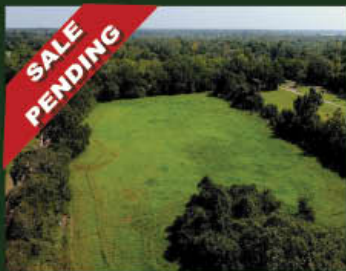
CR 151 in Boling 13 + Acres on San Bernard River $140,000