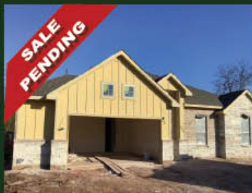
32802 Wild Willow Way 4 Bed / 3 Bath / 2,275 s.f. $420,875