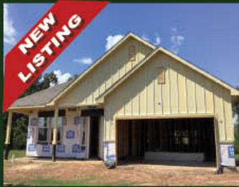
33010 Woodlake Dr. 3 Bed / 2.5 Bath / 2,461 s.f. NEW CONSTRUCTION $455,285