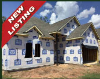
33006 Woodlake Dr. 3 Bed / 2.5 Bath / 2,641 s.f. NEW CONSTRUCTION $488,585