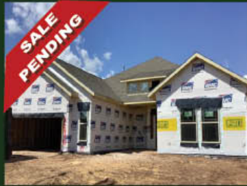
32910 Woodlake Dr. 3 Bed / 2.5 Bath / 2,450 s.f. NEW CONSTRUCTION $453,250