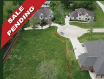
32823 Whistler Ct. Rare Weston Lakes Lot Half-Acre with plans $225,000