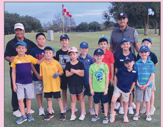
LGA Operation 36 Photo