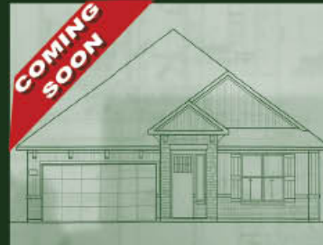
32026 Woodlake Dr. 4 Bed / 3 Bath / 2,455 s.f. New Construction $454,175