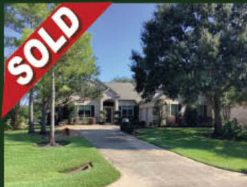
Weston Dr. 3 Bed / 2.5 Bath Golf Course Lot w/ Pool