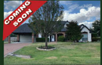
3,798 s.f. 4 Bed / 3.5 Bath with Pool