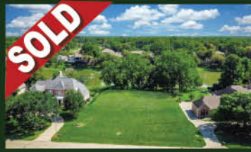
4510 Waterbeck Waterfront Lot on Oxbow Lake