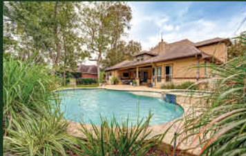
32411 Oxbow Lane 3,694 s.f. with Pool on Oxbow Island $589,000