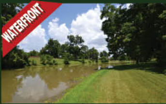
1/2 ACRE LOT 32618 Watersmeet $165,000

Buyers are looking, so call us about listing your home!