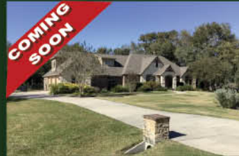
Over 3,700 s.f. 4 Bed / 3.5 Bath on 1.2 acres