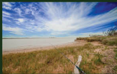
1357 Bay Dr., Palacios 0.968 Ac Bayfront Lot House Plans Available $89,000