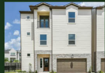
10930 Brookshire Chase Lane 3800, 3.5 Bath Near I-10 & Beltway 8 $439,900