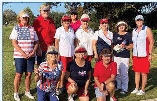
Veteran's Day - Group Pic