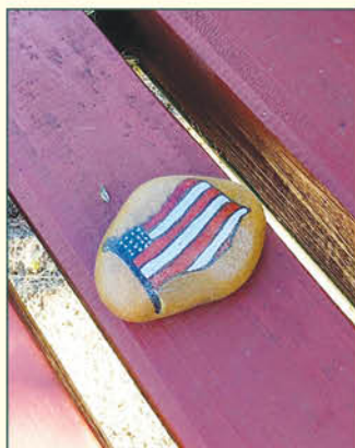
What a beautiful little gem found in Pecan Park. This is just one thing that shows Weston Lakes Proud.