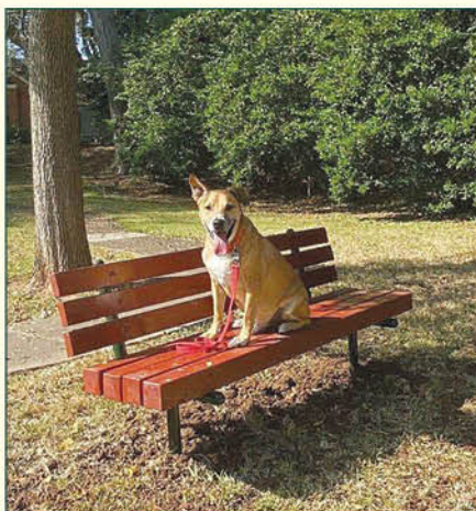
Even our four-legged friends will enjoy the new benches in The Village Park, Oxbow, Pecan Park, and Riverwood.

You may have noticed a few new benches, made by a craftsman in Simonton, throughout the parks in Weston Lakes. KWLB partnered with the POA in purchasing four new benches for all to enjoy. With everyone spending more time outdoors, it is a welcome sight to see so many fishing, walking, and just enjoying the great outdoors. And... you may be lucky enough to find one of the "painted rocks" that are being placed by our some of our wonderful neighbors.