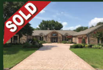
Almost 4,100 s.f. on Golf Course Lot 3 Bed / 4.5 Bath / Study