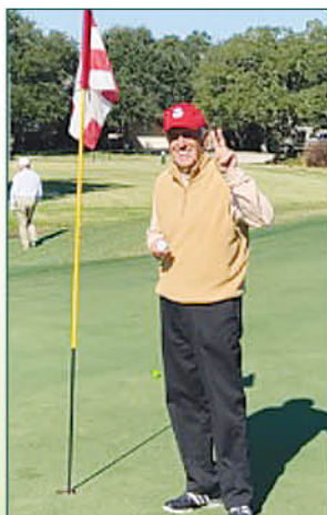
#13 on October 31

The annual Weston Cup was held over October 17 and 18. The Weston Cup has been a tradition for many years where the SMGA and MGA play against one another. Pairings for the weekend were made by the respective captains of SMGA and MGA. On Day 1 we played the Pinehurst format on the front nine. The SMGA won 6.5 to 5.5. The back nine was Best Ball and the MGA won 7.5 to 4.5.