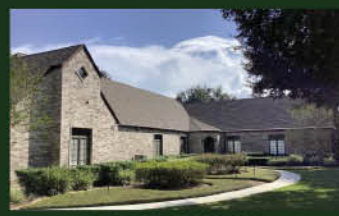
COMING SOON 4720 Westerdale 3,464 s.f. on 3/4 Ac. Golf Course Lot