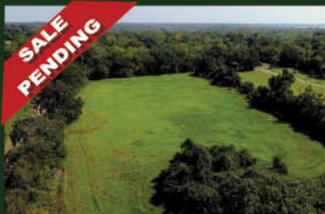
CR 151 in Boling 13 + Acres on San Bernard River $140,000