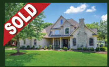
5519 Weston 4 Bed / 3.5 Bath View from #1 to #18