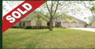
3108 Bowser Rd. 4 Bed, 3 1/2 Bath Private Entrance / .7 acre lot