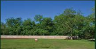
32823 Whistler Ct. Half Acre+ Lot In Prestigious Reserve Section 2 $132,000