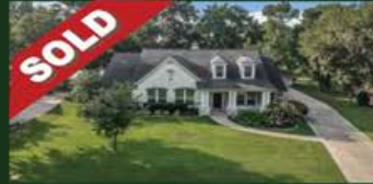
5018 Oxbow Circle East WATERFRONT HOME 3,554 s.f. / 3 Bed / 3.5 Bath