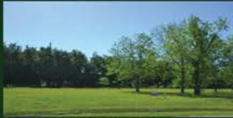
32723 Waterfowl Dr. 19,194 s.f. lot Backs up to Riverwood $93,500