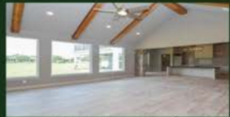
5011 Waterbeck 4,115 s.f. / 4 Bed / 4.5 Bath On Hole #6 Fairway $639,900