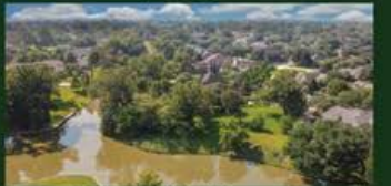
4710 Whickham Ct. 0.4663 Acre Waterfront Lot on Cul-de-sac $195,000