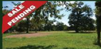
WESTHAVEN CT 1+ Acre Lot with Mature Trees Near Reserve Sec. 5 $140,000