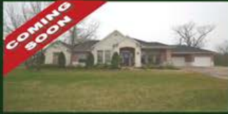
Oxbow Circle 4 Bed / 3.5 Bath POOL / 0.65 Acre Lot

Buyers are looking, so call us about listing your home!