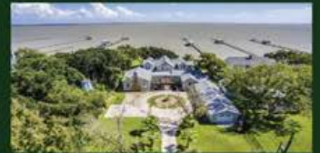
711 Bayridge Road Historic Home in Morgan's Point Completely Restored on Galveston Bay $990,000