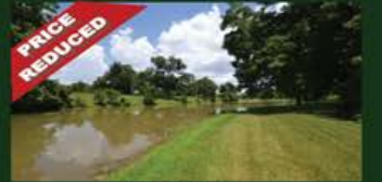
1/2 ACRE WATERFRONT LOT 32618 Watersmeet $165,000