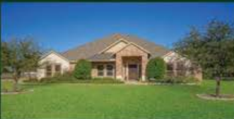
32522 Westminster 4 Bed, 5 Bath, 4 Car Garage Full In-Law Suite No Backyard Neighbor $774,900