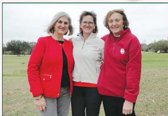
Some of the March Birthday Ladies