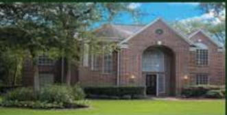
32715 Whitburn Trail 3,549 s.f. / 4 Bed / 3.5 Bath $449,000