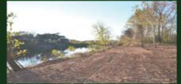
NEW LOTS With Brazos River Views CALL FOR DETAILS NO TIME LIMIT TO BUILD