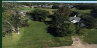
4606 Weston Dr. 0.4328 Acre Golf Course Lot on #15 Green $110,000