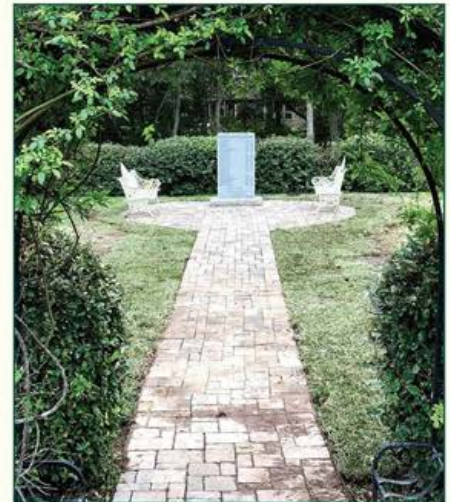
The Historical Randon Bottom Cemetery in Weston Lakes