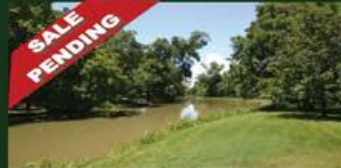
5319 Westerdale .60 Acres on PECAN LAKE $184,500