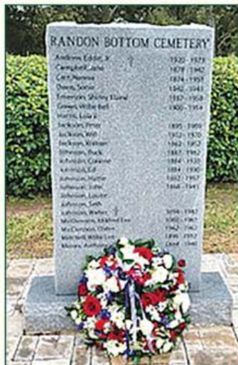
We honor all in our Randon Bottom Cemetery 2019

A special marker will be placed at the entrance of the cemetery for this designation in the near future by Keep Weston Lakes Beautiful and a Texas approved highway sign will be placed along FM 1093 to announce the presence of the historical site in our community.