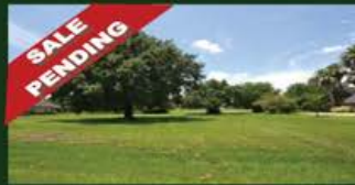
4015 Wentworth .75 Acres at #9 GREEN $169,500