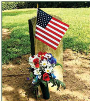
Honoring those who served. We are forever grateful.