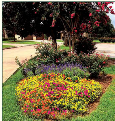
The Villas Adopt-a-Spot is one of our beautification jewels taken care of by neighbor volunteers

summer and enjoy our very own butterfly garden in Pecan Park.