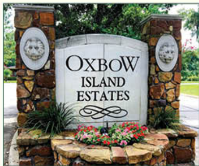
Oxbow is another beautiful example of another neighborhood Adopt-a-Spot

Thank you to the residents of Fairway Villas and Oxbow Island Estates for participation in our Adopt-A-Spot program! The Keep Weston Lakes Beautiful Adopt-a-Spot program allows an individual, family, or