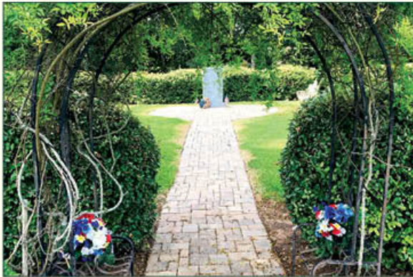
The Historical Randon Bottom Cemetery in Weston Lakes showing pride on the 4th of July