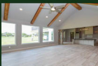
5011 Waterbeck 4,115 s.f. / 4 Bed / 4.5 Bath On Hole #6 Fairway $639,900