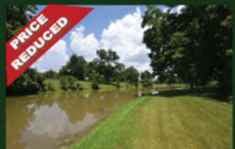
1/2 ACRE WATERFRONT LOT 32618 Watersmeet $165,000