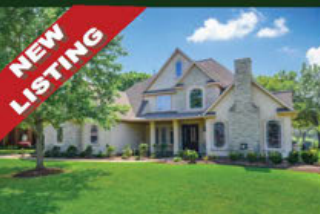
5519 Weston 4 Bed / 3.5 Bath View from #1 to #18 $475,000