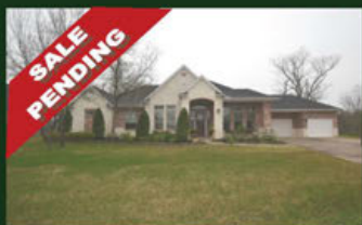
4202 Oxbow Circle East 4 Bed / 3.5 Bath POOL / 0.65 Acre Lot $564,900