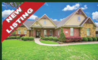
4319 Weston 4 Bed / 3.5 Bath POOL $489,000