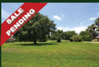
4015 Wentworth .75 Acres at #9 GREEN $169,500