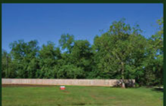
32823 Whistler Ct. Half Acre+ Lot In Prestigious Reserve Section 2 $132,000