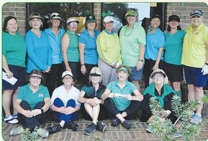
Group Picture of March Scramble