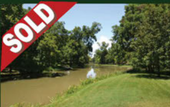
5319 Westerdale .60 Acres on PECAN LAKE