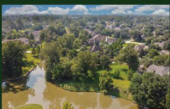
4710 Whickham Ct. 0.4663 Acre Waterfront Lot on Cul-de-sac $195,000