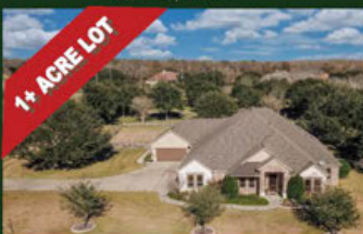
32522 Westminster 4 Bed, 5 Bath, 4 Car Garage Full In-Law Suite No Backyard Neighbor $749,900