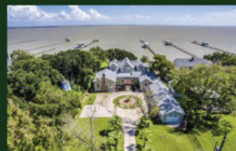
711 Bayridge Road Historic Home in Morgan's Point Completely Restored on Galveston Bay $990,000