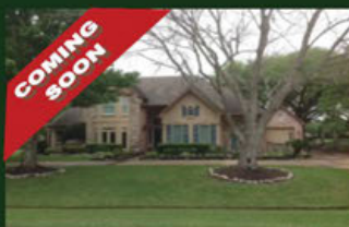
Whitburn Trail Weston Lakes Custom Home on Golf Course