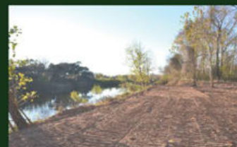
NEW LOTS With Brazos River Views CALL FOR DETAILS NO TIME LIMIT TO BUILD