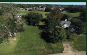
4606 Weston Dr. 0.4328 Acre Golf Course Lot on #15 Green $110,000