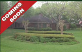
Waltham Crossing Weston Lakes One-Story on a Corner Lot