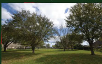
4716 Westerdale Over 3/4 Acre On #7 Green / #8 Tee $145,000