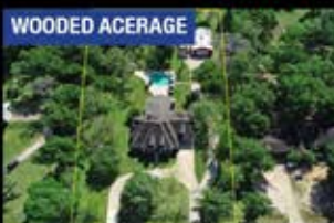
WOODED ACERAGE Richmond 202 Carroll Road 4/3 & 2 1/2/2 POOL, SPA, GAZEBO & WORK- SHOP. Summer Kitchen. LOW TAXES! $550,000