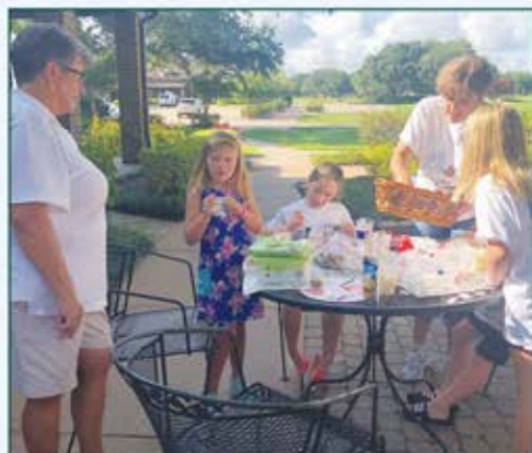
Summer Recycling Education with KWLB, learning that it's never too early to start taking care of our planet.