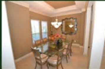
33226 Worthing 2,250 sq.ft. on Corner Lot $285,000