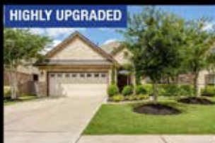
HIGHLY UPGRADED Cinco Ranch 4814 Sequoia Park Ln 4/3/2 Highly Upgraded 2 story. With- in walking distance of the local Elementary School. $330,000