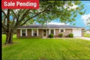
Sale Pending North Fulshear Estate 6309 Sprigg St 3/2/1 A rare find! Remodeled 1 Story on 1 Acre with a Pool. $299,000