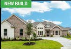
NEW BUILD Weston Lakes 32810 Wall Flower 4/3 & 3 1/2/3 Energy efficient 1.5 story with side entry 3-car Garage. $499,000