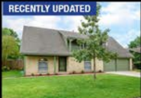
RECENTLY UPDATED Meadows Place 12311 Alston Dr 4/2/2 Recently updated home nes- tled on a quiet street. Over- sized lot. $249,000