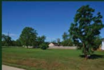
SELECTED LOTS IN THE RESERVE AT WESTON LAKES CALL FOR DETAILS