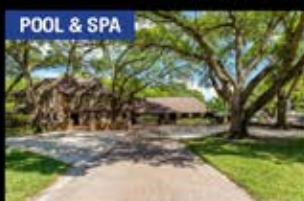
POOL & SPA Katy 2800 Avenue D 5/5.5/1 An entertainers dream! Color- ful landscaping, Pool & Spa & a guest house. $875,000