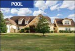
POOL Fulbrook 4526 Box Turtle Ln. 3/3.5/3 Remodeled 1.5 Story on a stunning 1.1 Acres & Dipping pool. $499,000