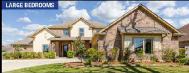
LARGE BEDROOMS Weston Lakes 4423 Warington St. 4/3.5/2 2 Story. Designer tiles, fine granites, and custom built-in cabinetry $435,000