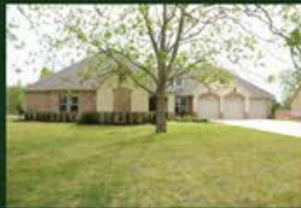
3108 Bowser Rd. 4 Bed, 3 1/2 Bath Private Entrance/ .7 acre Lot $540,000