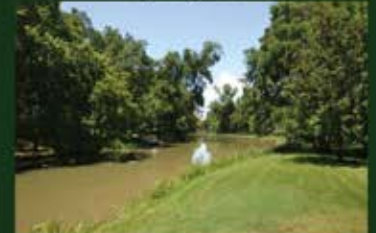
5319 Westerdale .60 Acres on PECAN LAKE $190,000