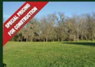
32919 WHITBURN TRAIL 0.92 Acre Lot with Views of #11 Green & Pond $149,900