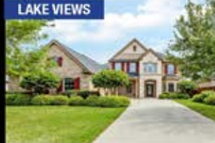
LAKE VIEWS Cross Creek Ranch 5907 Fulshear Plantation Dr 5/4.5/3 2-Story, mature landscaping, Cul-de-Sac. Plenty of space with Lake Views. $435,000