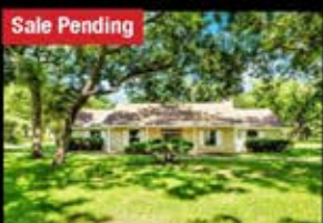
Sale Pending Brazos Valley 726 Surrey Dr. 3/2/2 Completely Remodeled open concept 1-story Ranch Home Wooded Lot $197,750