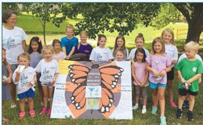
Summer time in Pecan Park learning about Monarch Butterflies