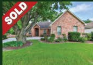
4415 Wickby 3 Bed, 2 Bath, 2,301 sq.ft.