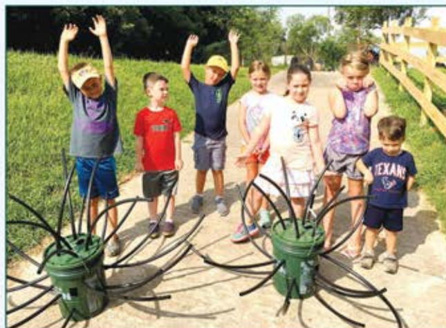
Fish Habitat Fun

Weston Lakes is truly a special place to live, not perfect, but look at all these children's faces and it doesn't get much better than that!