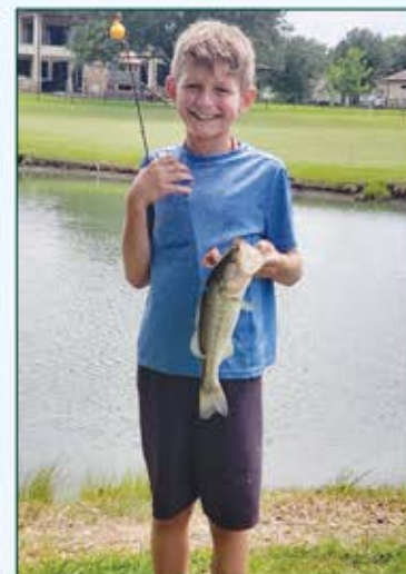
The smile says it all