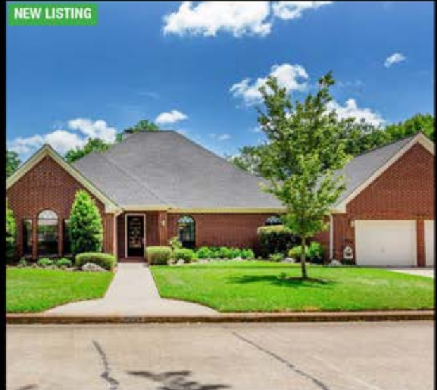
NEW LISTING Weston Lakes 4802 Lake Village Dr. 3/2.5/2 Waterfront Single Story with screened in back porch. Did not flood! $299,000