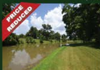
1/2 ACRE WATERFRONT LOT 32618 Watersmeet $165,000