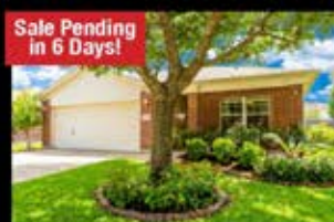
Sale Pending in 6 Days! Katy 4814 Cliffpoint Ct 3/2/2 Updated single story on Cul- de-Sac. Wide plank wood floors. $189,500