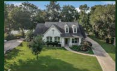
5018 Oxbow Circle East WATERFRONT HOME 3,554 s.f. / 3 Bed / 3.5 Bath $499,000