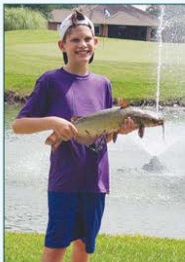
The BIG Fish!