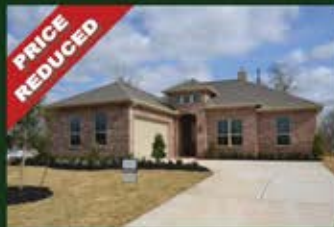
NEW PATIO SECTION 3806 Wild Willow Way 3 Bed, 2 Bath, 1,975 sq.ft. $285,000