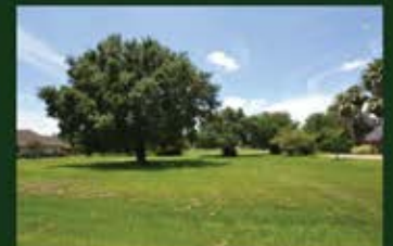
4015 Wentworth .75 Acres at #9 GREEN $169,500