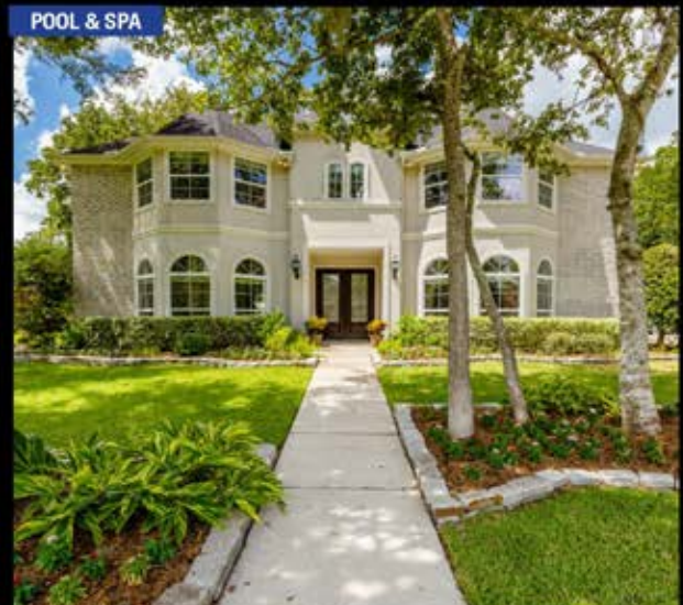
POOL & SPA Weston Lakes 3511 Wellspring Lake 5/3.5/3 2-story Mediterranean Beauty on 1.1 Acre Lot. Salt water POOL. $895,000