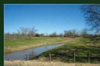
46.3 acres at Rogers Rd. & Pool Hill Rd. $1,853,000