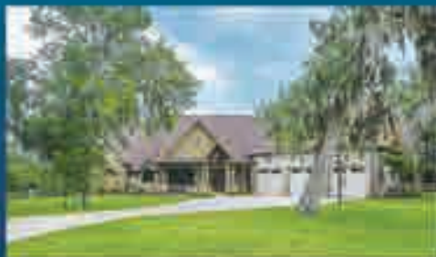
3007 Wellspring Lake Dr . $799,999 . MLS 2126142