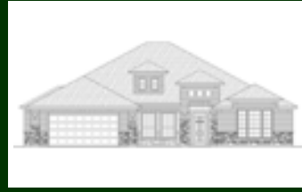
UNDER CONSTRUCTION 32807 Waterfowl 4 Bed / 3 Bath with study