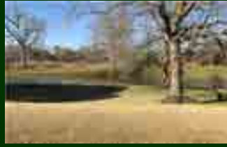
1/2 ACRE WATERFRONT LOT 32618 Watersmeet $179,500