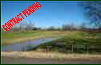
CONTRACT PENDING 46.3 acres at Rogers Rd. & Pool Hill Rd. $1,853,000