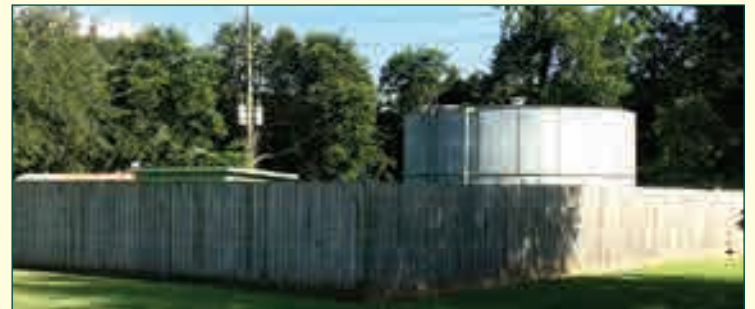
KWLB Aqua Texas Riverwood Water Tank

If you would like more information on how you can get involved, please go to: keepwestonlakesbeautiful@gmail.com