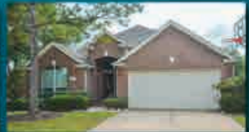
4914 Saffrey Park . $260,000 . MLS 78546384