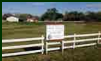
FULL CITY BLOCK IN FULSHEAR FM 359 Frontage $1,500,000