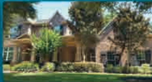
32419 Oxbow Ct . $520,000 . MLS 19286280