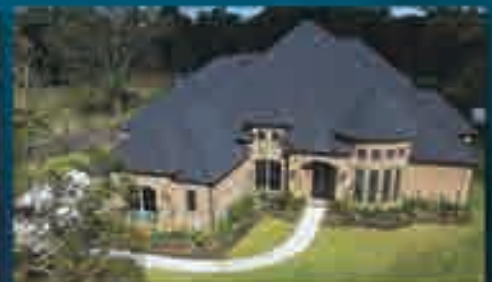
32822 Woodfern . $589,000 . MLS 15983264