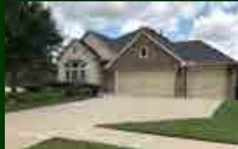
ONE STORY IN CROSS CREEK 6503 Tamarind Sky $324,900