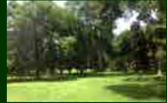
RARE 0.8-ACRE WOODED GOLF COURSE LOT—WHITBURN TR. $210,000