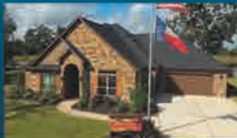
3623 Wellborn . $695,000 . MLS 4438044