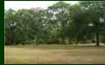
W. DEERWOOD IN ROLLING OAKS 2.93 Acre Lot in Cul-de-sac $299,900