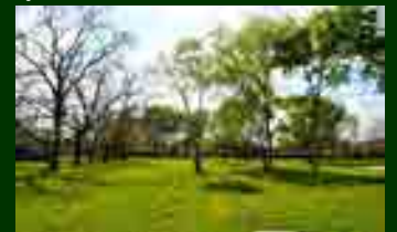
1+ ACRE LOT IN FULBROOK 5327 Harris Woods Trace $127,000