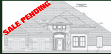
32715 Waxberry-Under Construction 3 Bedrooms, 2 1/2 Baths Cul-de-sac Street