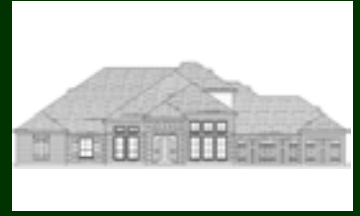
UNDER CONSTRUCTION 32807 Woodfern Ct. 4 Bed / 3 Bath & 2-1/2 Bath Upstairs Media & Game Rooms