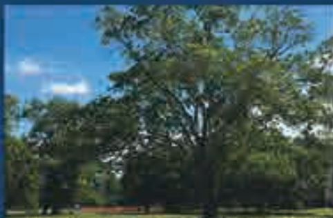
32806 Woodfern Ct . $189,000 . MLS 67940280