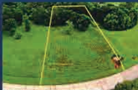
32919 Whitburn Trail . $175,000 . MLS 17959742