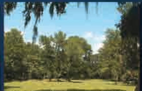
3502 Woodtime Dr . $275,000 . MLS 14398004