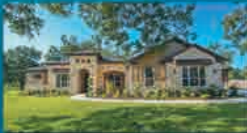
32823 Woodfern . $659,250 . MLS 45349454