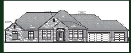
32803 Wall Flower-Under Construction 4 Bedrooms, 3 1/2 Baths, on Wooded Lot. You can choose your finishes.