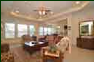
GREAT PATIO HOME 32643 Wingfoot Cir. $273,500