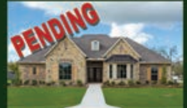
PENDING SALE PENDING 33302 Winsford $375,000