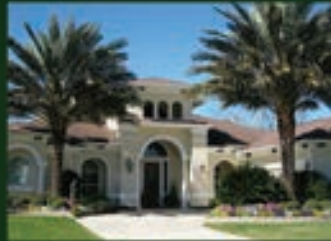
GREAT HOME on #8 Green 4403 Wentworth $475,500 REDUCED