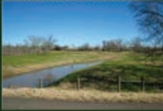
AVAILABLE 46.3 acres at Rogers Rd. & Pool Hill Rd. $1,853,000