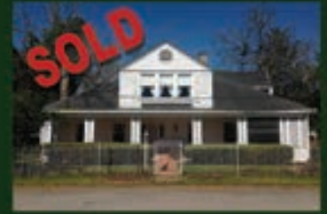
SOLD Historic Home at 30406 2nd St. in Fulshear