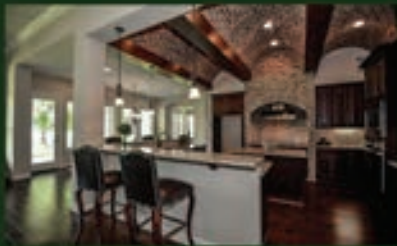
NOW AVAILABLE - CALL TO SEE! 32814 Waterfowl $524,900