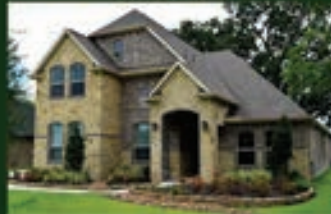
AVAILABLE MODEL HOME 3627 Wellborn $489,900