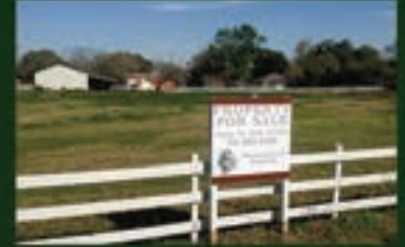
AVAILABLE 2+ acres on FM 359 Across from Dozier's BBQ $1,800,000