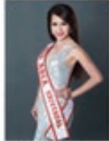
Mrs. Asia Universal Spa Owner