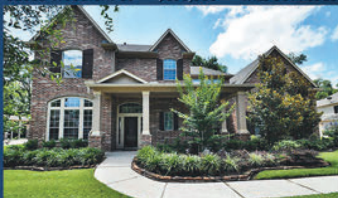
32419 Oxbow Ct $499,999 MLS 66822728