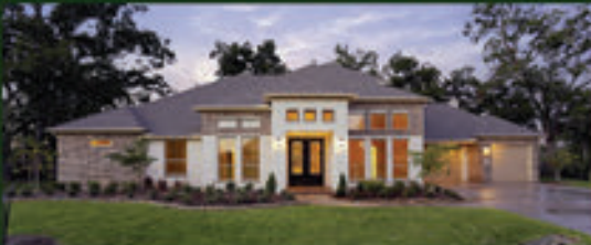
32814 Waterfowl COMING SOON with Similar Curb Appeal $525,000