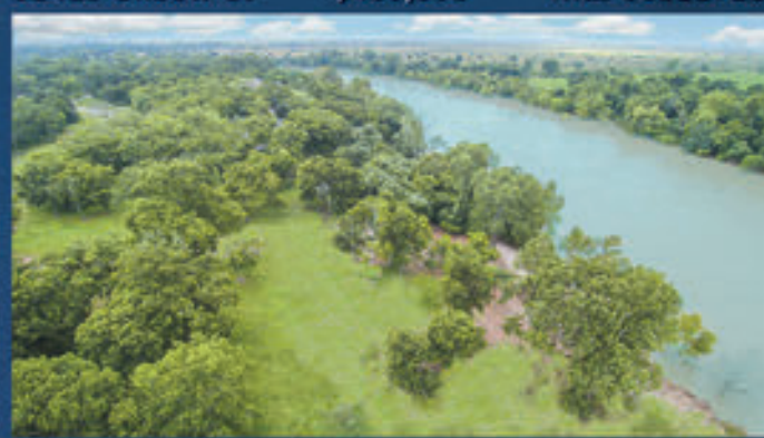
Lot 12 Wellspring Lake $279,000 MLS 2440969