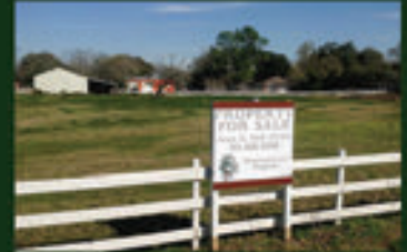
AVAILABLE 2+ acres on FM 359 Across from Dozier's BBQ $1,800,000