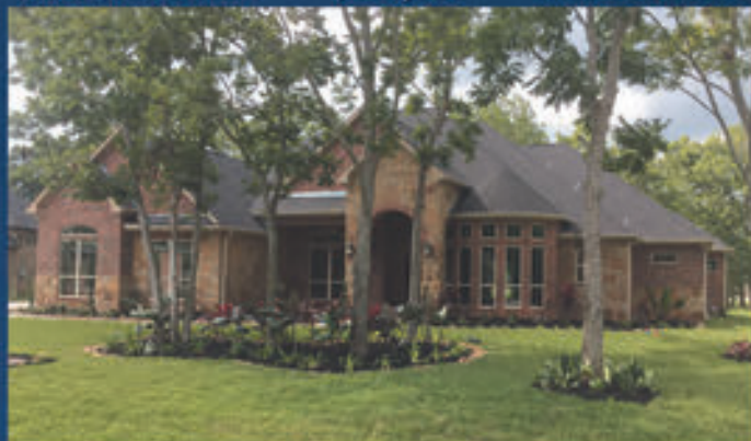
32818 Woodfern Ct $699,500 MLS 36776519