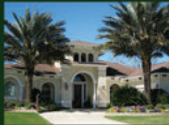
GREAT HOME on #8 Green 4403 Wentworth $475,500 REDUCED