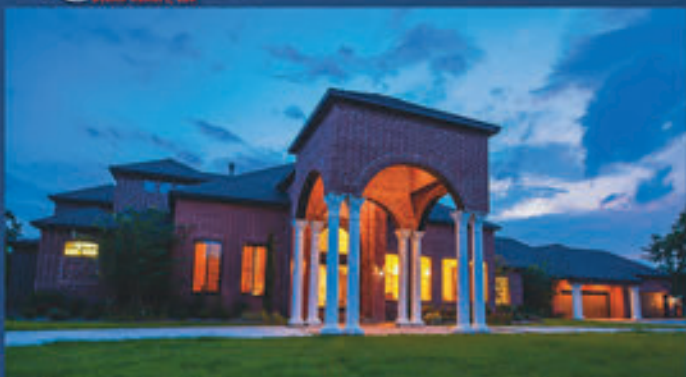
5511 Westerham $1,125,000 MLS 56171546