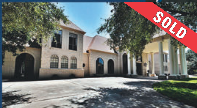
4910 Westerham $699,000 MLS 15206248