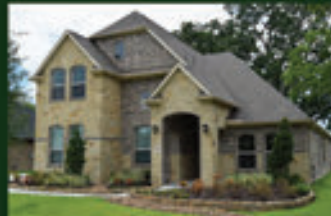
AVAILABLE MODEL HOME 3627 Wellborn $499,900