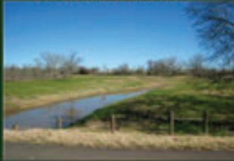
AVAILABLE 46.3 acres at Rogers Rd. & Pool Hill Rd. $1,853,000