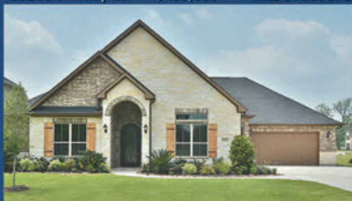
32811 Warbler $629,000 MLS 87846632