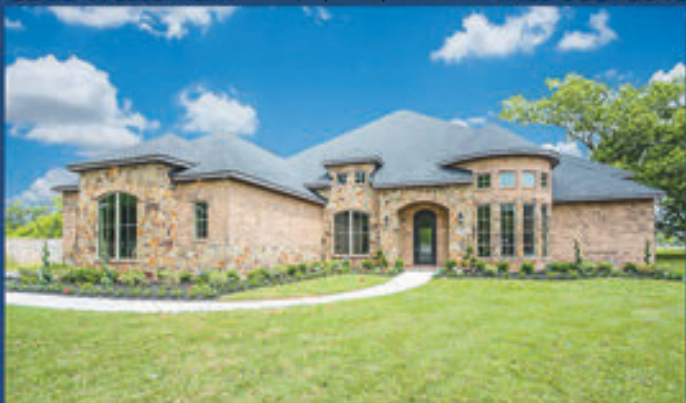
32822 Woodfern Ct $649,000 MLS 31412111