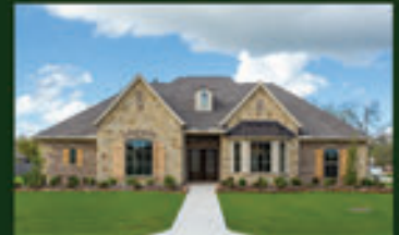
AVAILABLE 33302 Winsford $375,000