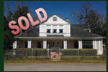
SOLD Historic Home at 30406 2nd St. in Fulshear